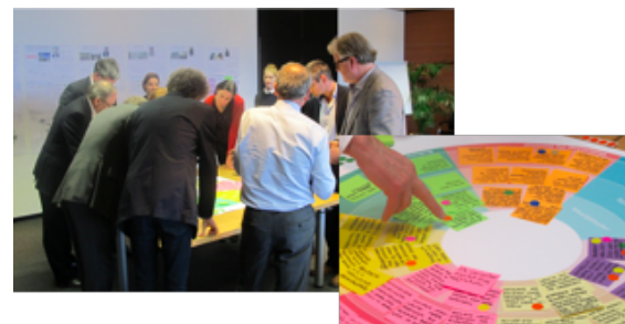
Figure 3: Picture of the stakeholder workshop: making connections with the Value Pursuit

The participants were asked if they agreed with the information presented and were also given the opportunity to add additional information if it was required. After this initial round of getting acquainted, participants were asked to take a closer look at each other’s struggles and reflect over what they could contribute to the networks. By having the data readily available, the participants could immediately start to make connections between participants’ contributions and struggles, discovering opportunities for new collaborations.