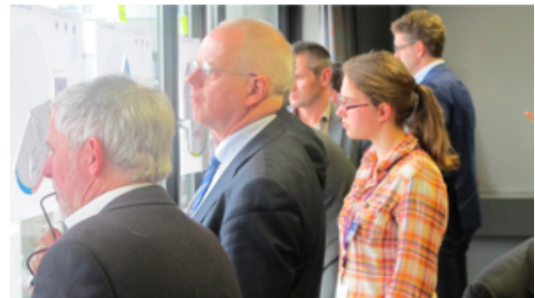
Figure 6: Stakeholders engaging in the themes during the 'Water day'.

After combining the input from this workshop with the earlier results, nine important themes were formulated for which further dialogue was desired. Additionally, for each theme several stakeholders indicated what they would be willing to contribute. This gave the Province a good starting point for further dialogue with these particular stakeholders, wherein their contributions would be concretized. Later, a third workshop was run with a selected group of stakeholders to further explore one of the themes that came up in the second workshop: Health and Water management.