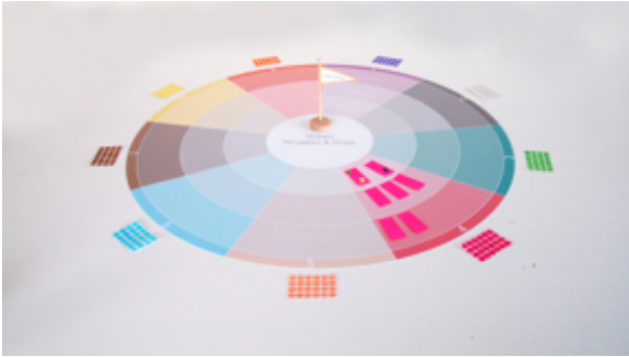
Figure 1: Value Pursuit game board