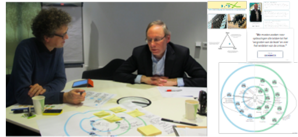
Figure 2: One-on-one interviews with key stakeholders, an example of a profile and stakeholder map

In preparation for the workshop with the Province of Noord Brabant, one-on-one interviews with the “key stakeholders” were therefore conducted to explore their different perspectives. Following the core principles of the Value Pursuit tool, STBY interviewed each stakeholder on how they were related to the groundwater theme: what are their activities? What are they trying to achieve - both personally as professionally and with whom are they interacting to achieve this? Following the interviews, a first round of analysis was conducted by STBY to collect the necessary input to use in the Value Pursuit workshop: for each stakeholder a profile sheet and stakeholder map was created. In addition, the aims, contributions and struggles were formulated for each stakeholder and plotted on the Value Pursuit board. Through visualizing the interviews as stakeholder profiles and maps, it was possible to share and discuss the input in a manner that was understandable to everyone involved.