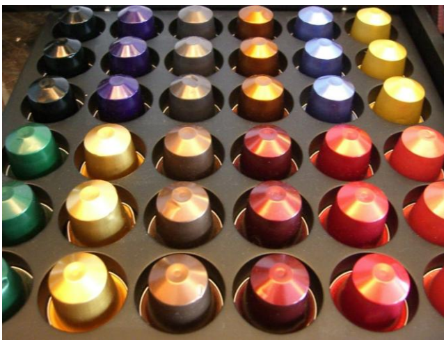
Figure 2. The Nespresso coffee cups

experience, making that both manifestations enhance each other. For example, the Nespresso PSS system: both the coffee machine and the coffee cup service – in which cups are sent by mail rather than being available in supermarkets – express ‘exclusivity’, which is how apparently Nespresso wants to position itself in the market. Coherence and a synergetic user experience require first of all that the different parts of the system adhere to the same strategy as regards to user experience.