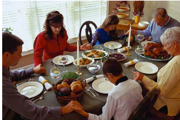
Fig. 6. A family dinner table with praying before

During the normal opening at our exhibition the space around the table will be arranged in a way that it would be natural for people to sit down to pray or to meditate. Maybe this place should rather be called a ‘house’ than a gateway. A house where the mystical movement of unification in the gift of the self, thanksgiving and transformation is at hand for everyone individually, but only when entering into and partaking in the movement of the complete community of all people. This then is every time a passing and in that sense a gateway to life out of the source that flows towards us.